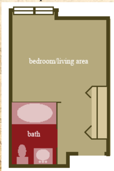
Madison & Madison Private & Semi-Private Studio Apartments